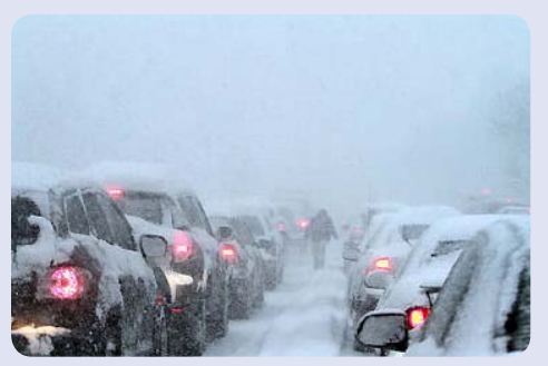
Cleveland Blizzard '10 Traffic nightmare