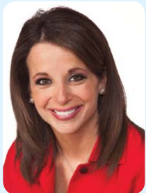
Hollie Strano WKYC TV 3 Channel 3 News Today