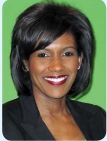
Kimberly Gill WEW TV 5 Good Morning Cleveland